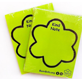
Kind Notes English | Spanish Lined | Primary Lined