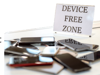
Be Kind Online Guide